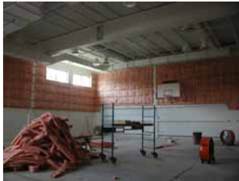
Above , the gym with basketball hoop. At right , a workman transports a door. Below , the art room.