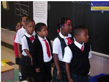
MCPS kindergartners line up for recess.

Welcoming the children of urban Milwaukee since 1997, Milwaukee College Prep celebrated its 10th anniversary this fall with an expanded building, a new playground, and a fully equipped computer lab donated by an area business. This K-8 school that has been described as the “Miracle on 36th Street” (it’s located on North 36th Street in the city), has changed students’ lives by providing an education and expectations that lead to enrollment in the top high schools in the city and country, including Phillips Exeter Academy and Brookfield Academy.